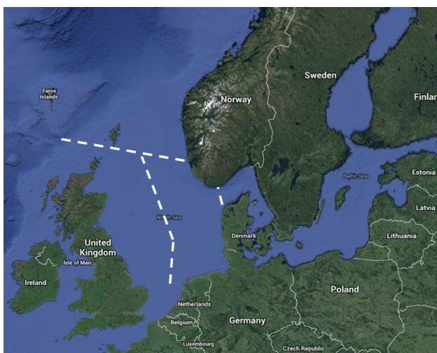
Fig. A8.3. Alternative Management Units for Porpoises in the North Sea, based on De Luna et al. (2012), Weimann et al. (2010), and Andersen et al. (2001)