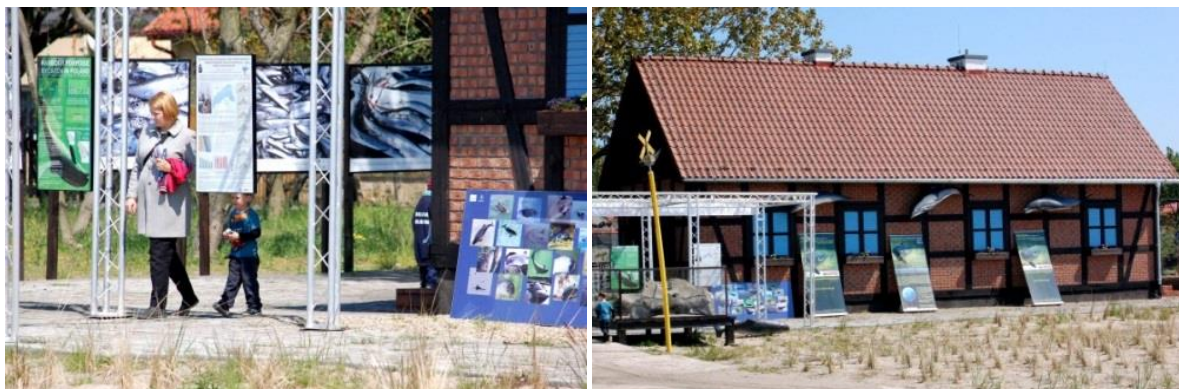
Hel Marine Station, Poland

Employees of the Hel Marine Station answered visitors’ questions and guided them around the exhibition and museum. Guests visiting the museum were particularly interested in films presenting observations of dolphins and whales sometimes appearing in Polish coastal waters. Many were surprised that in addition to the native porpoises, visitors to Polish waters include common dolphins and occasionally such rare animals as humpback or fin whales.