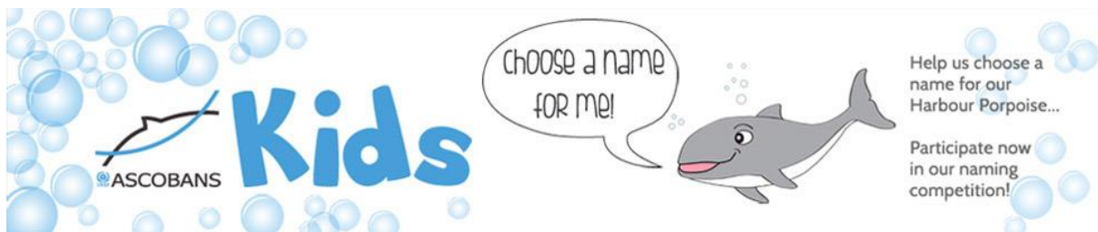
ASCOBANS Kids ( www.kids.ascobans.org)

In March 2014, the ASCOBANS Secretariat presented a new website for children to the public, "ASCOBANS Kids" ( www.kids.ascobans.org ). In the run-up to IDBHP, a naming competition was held for the website's mascot, a little cartoon harbour porpoise.