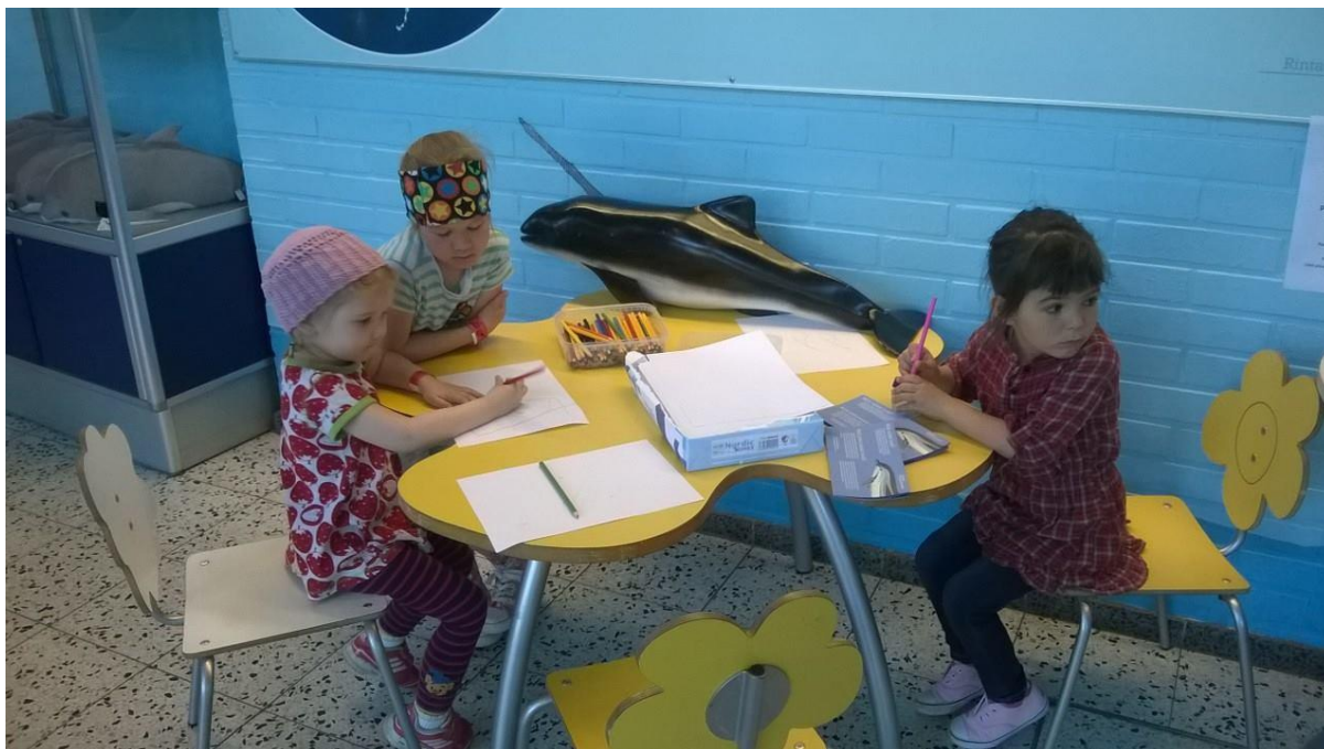
Tampere, Finland

The Sarkänniemi Dolphinarium in Tampere used the opportunity afforded by the IDBHP to inform visitors about the harbour porpoises in Finnish waters, the threats they face, the country's engagement in ASCOBANS, as well as conservation and sightings projects. A drawing contest for children was again very popular and information material was distributed.