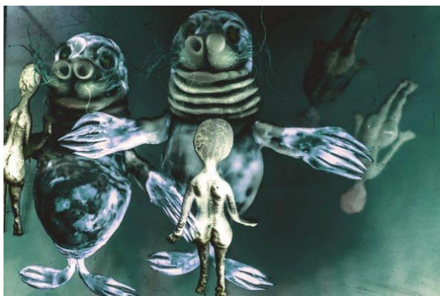
Lithuanian Sea Museum

The events were followed by the programme of the Long Night of Museums, during which a film on the harbour porpoise by director Vytautas Jankevičius was premiered. The evening finished with the performance of Linas Švirinas “Grock” studio together with the dolphins called “The wave of clean music”.