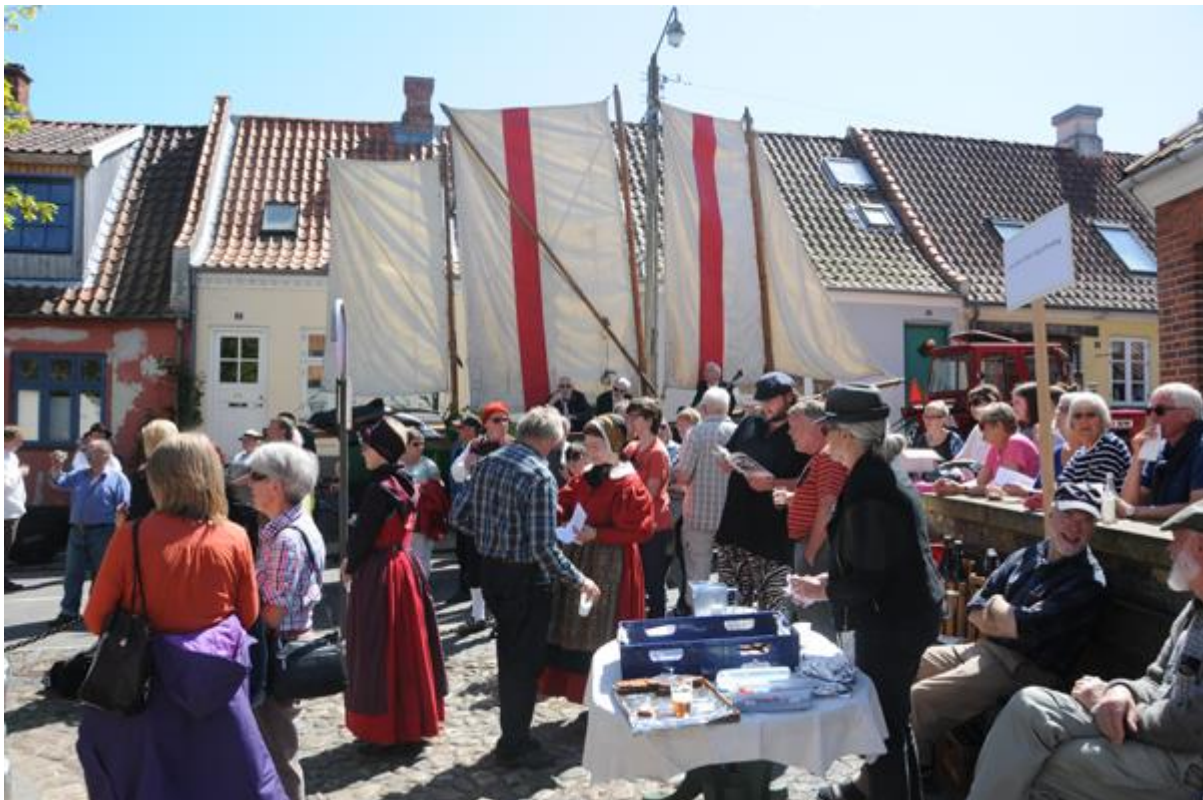
Middelfart, Denmark

In the small town of Middelfart in Denmark the International Day of the Baltic Harbour Porpoise was celebrated to commemorate the town's historical porpoise hunt and to highlight present-day conservation efforts. The website of the Middelfart Museum provides more information on the celebrations (in Danish).