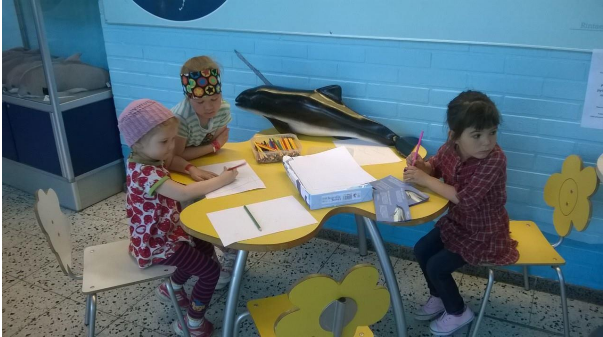
Tampere, Finland

The Sarkänniemi Dolphinarium in Tampere used the opportunity afforded by the IDBHP to inform visitors about the harbour porpoises in Finnish waters, the threats they face, the country's engagement in ASCOBANS, as well as conservation and sightings projects. A drawing contest for children was again very popular and information material was distributed.