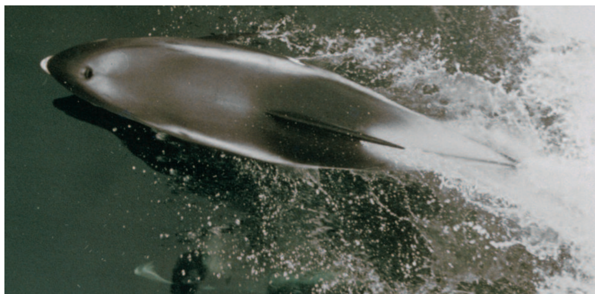
Fig. 12.27 Dorsal view of a white-beaked dolphin, showing both the beak and the characteristic black/white pattern on the flanks.

Very stout torpedo-shaped body, rounded snout