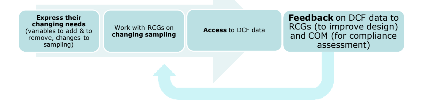
Figure 3.2.8: Different roles of end users in the DCF

One of the key changes to the DCF that all stakeholders agree on is that it should more adequately reflect end user needs and be more flexible to address changes in end user needs. As a basic principle, end users should provide input to the EU MAP regarding their needs, and that the most important of these new needs should be taken on board by MS, but it is also acknowledged that this will have impacts on the sampling plans in MS, cost implications for MS, and will require some time before the end user requests can result in new data collection. There is a valid concern by all MS that giving more say to end users on their needs could result in a ratchet effect whereby end users request ever more data. Realistically, it is likely that end user input will indeed more often concern additions of new variables, as assessment models improve for example, rather than removal of variables. A clear process is required to determine who and how the various requests by end users will be made, filtered and prioritized to end up with a final agreed list of new variables to be collected, and then injected into the sampling process to produce new sampling plans covering these new needs.