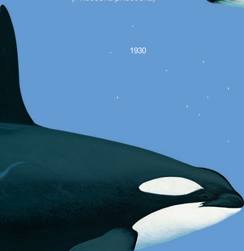
( Orcinus orca )