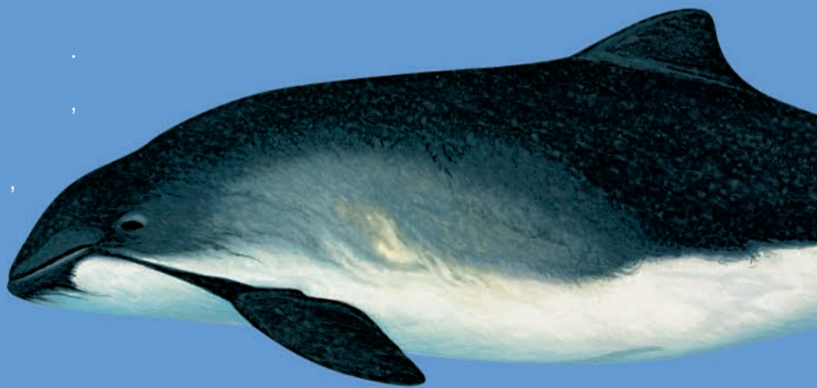
( Phocoena phocoena )