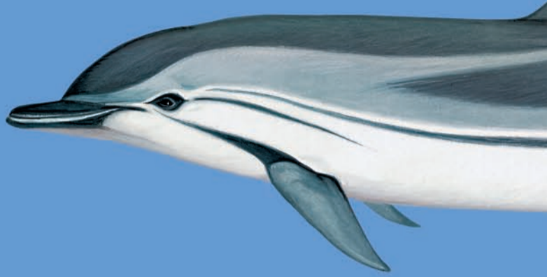
( Stenella coeruleoalba )