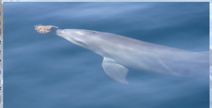
"Sponging" bottlenose dolphin

Through this resolution, Parties recognize that a number of socially complex mammalian species, such as several species of cetaceans, great apes and elephants, show evidence of having non-human culture and that this has implications for the efforts to conserve them. Parties are urged to consider culturally transmitted behaviours when determining conservation measures for such species, and to apply a precautionary approach to the management of populations for which there is evidence that culture and social complexity may be a conservation issue.